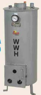
HOT WATER AND WOOD FIRED